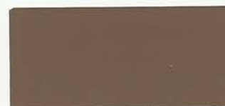
Cocoa Brown #119